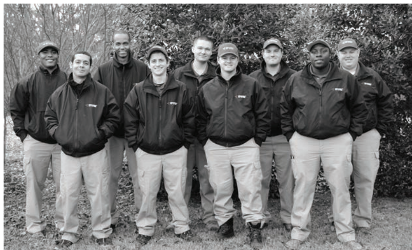
The Triangle Crew

The full line of Essentria products adds a natural offering to Zoëcon Professional Products’ robust lineup of pest-control solutions providing quick kill with a FIFRA 25(b) exempt distinction.