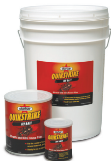
EPA Reg. #2724-812

For industrial, residential commercial and agricultural settings indoors and outside the non-food/feed areas of restaurants, barns, taverns, supermarkets, commissaries and bakeries.