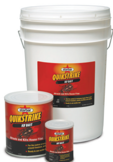
EPA Reg. #2724-812

For industrial, residential commercial and agricultural settings indoors and outside the non-food/feed areas of restaurants, barns, taverns, supermarkets, commissaries and bakeries.