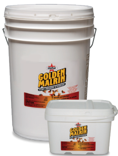
EPA Reg. #2724-274

Bait Station - Position one bait station in each 250 square feet of area with up to 2 ounces of bait per station.