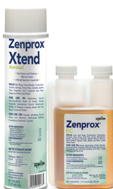
Zenprox® Xtend Aerosol and Zenprox® EC Insecticide