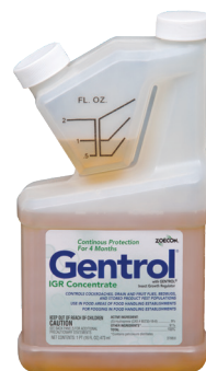
Gentrol® IGR Concentrate Synthetic insect growth regulators