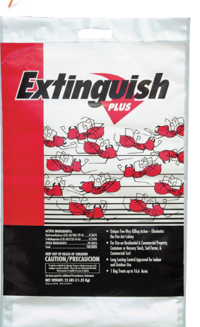
Extinguish® Plus Insecticide